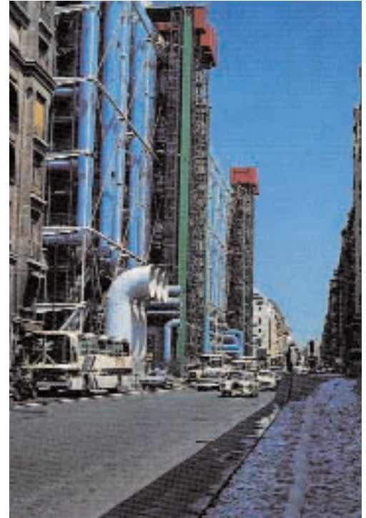
Plate 7.2 Pompidou Centre, Paris