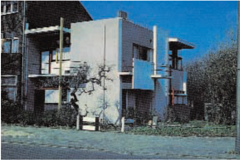
Plate 7.1 Reitveld House, Utrecht, Holland