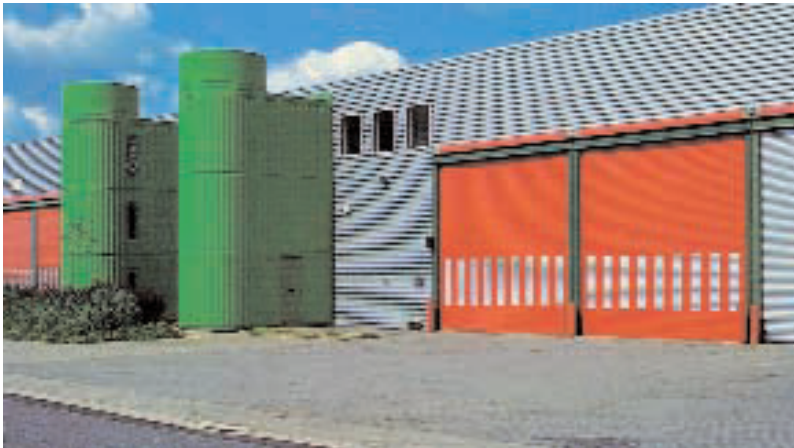
Plate 7.3 Contrasting colours at Castle Park, Nottingham