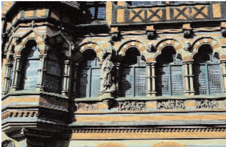
Plate 7.4 Polychromatic brickwork in a highly decorated façade, Watson Fothergill's office, Nottingham