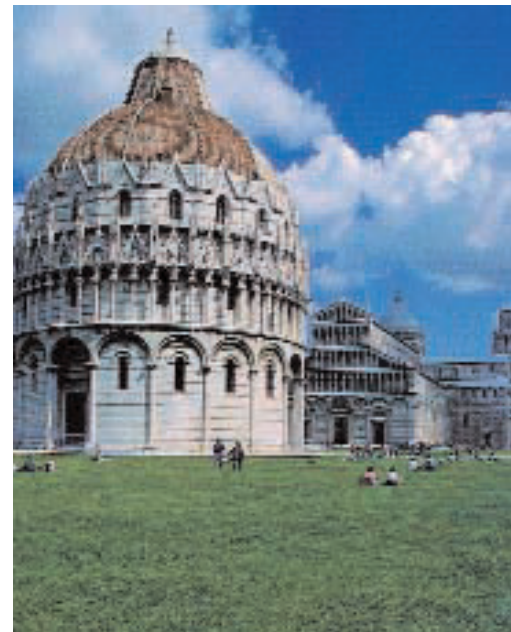
Plate 7.6 Camp dei Miracoli, Pisa